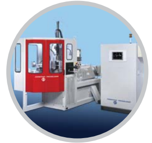
Santoprene TPVs are used in the PRESSBLOWER process from Ossberger GmbH + Co.*

in this demanding environment. The majority of automobiles use Santoprene TPVs for their flexibility and resistance to heat and oil. Santoprene TPVs have demonstrated long-term durability in steering boots since 1983. And, while rack and pinion steering boots represent only a small percentage of the total cost of the steering system to manufacture, a reduction in costs is a welcome bonus.